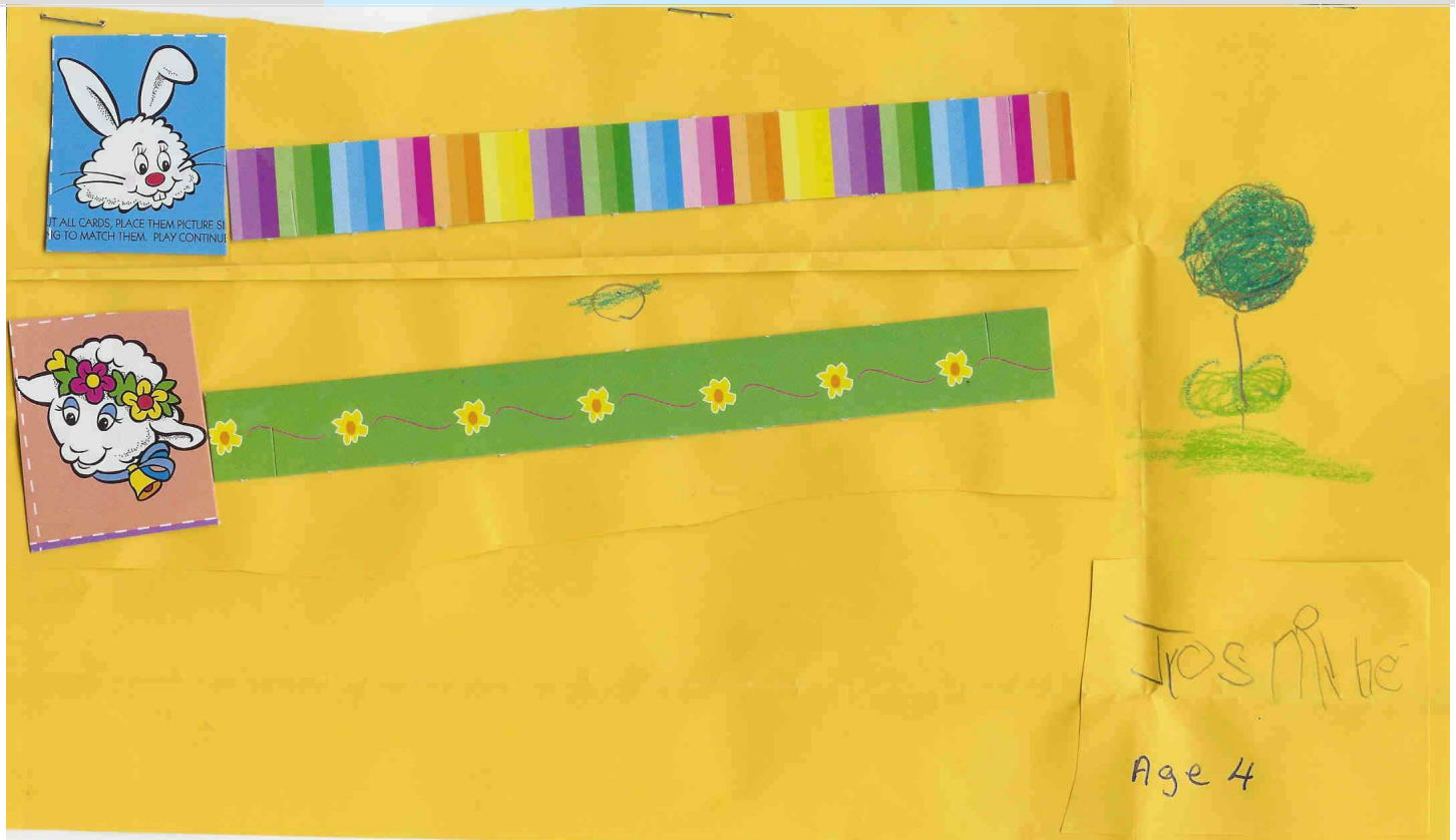
Jasmine is a very low key 4 year old that loves art activities!